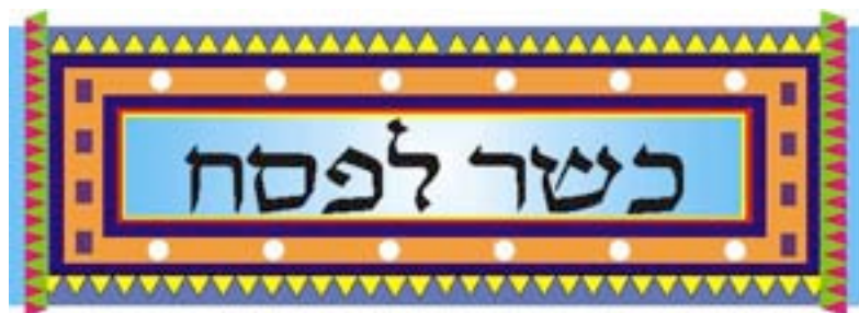
Kosher for Passover

You can become an 'ASSOCIATE MEMBER' of Shalom Scripture Studies, Inc. by your faithful financial support of this ministry.